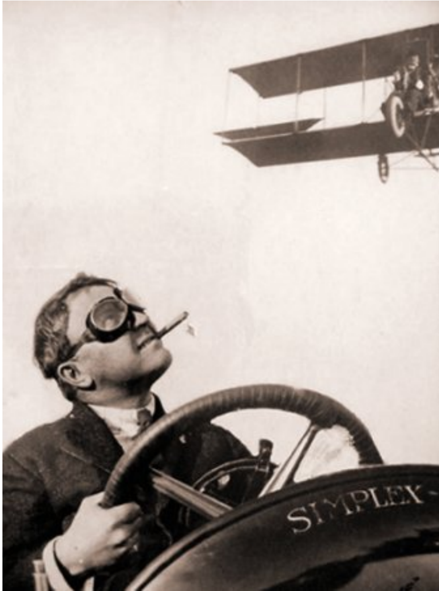
Barney racing an airplane on the sands of Daytona Beach to publicize his record-breaking 131mph speed.