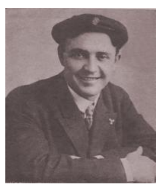
This portrait was made when he was still interested in bicycle racing