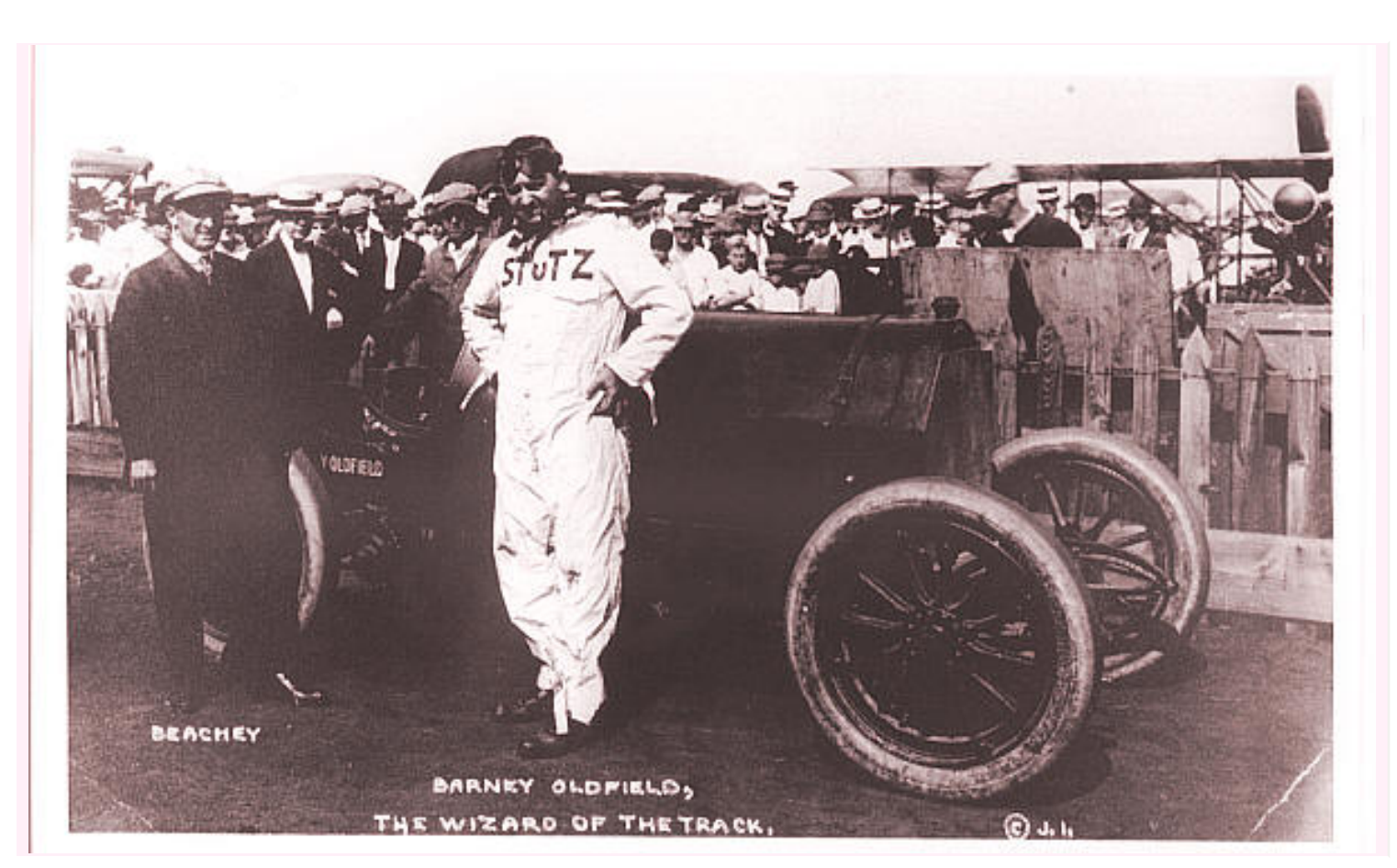
Barney Oldfield, "The Wizard of The Track"